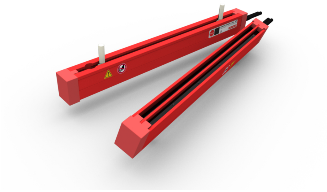
Illustration 1: EI DC